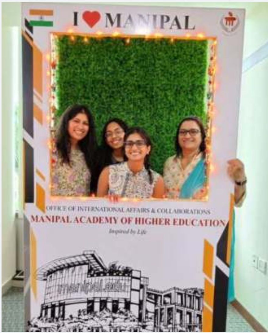
Touro University, California