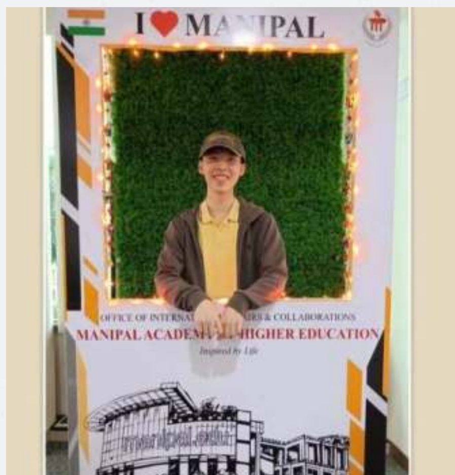
University of Liverpool, United Kingdom