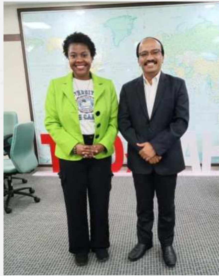
University of North Carolina