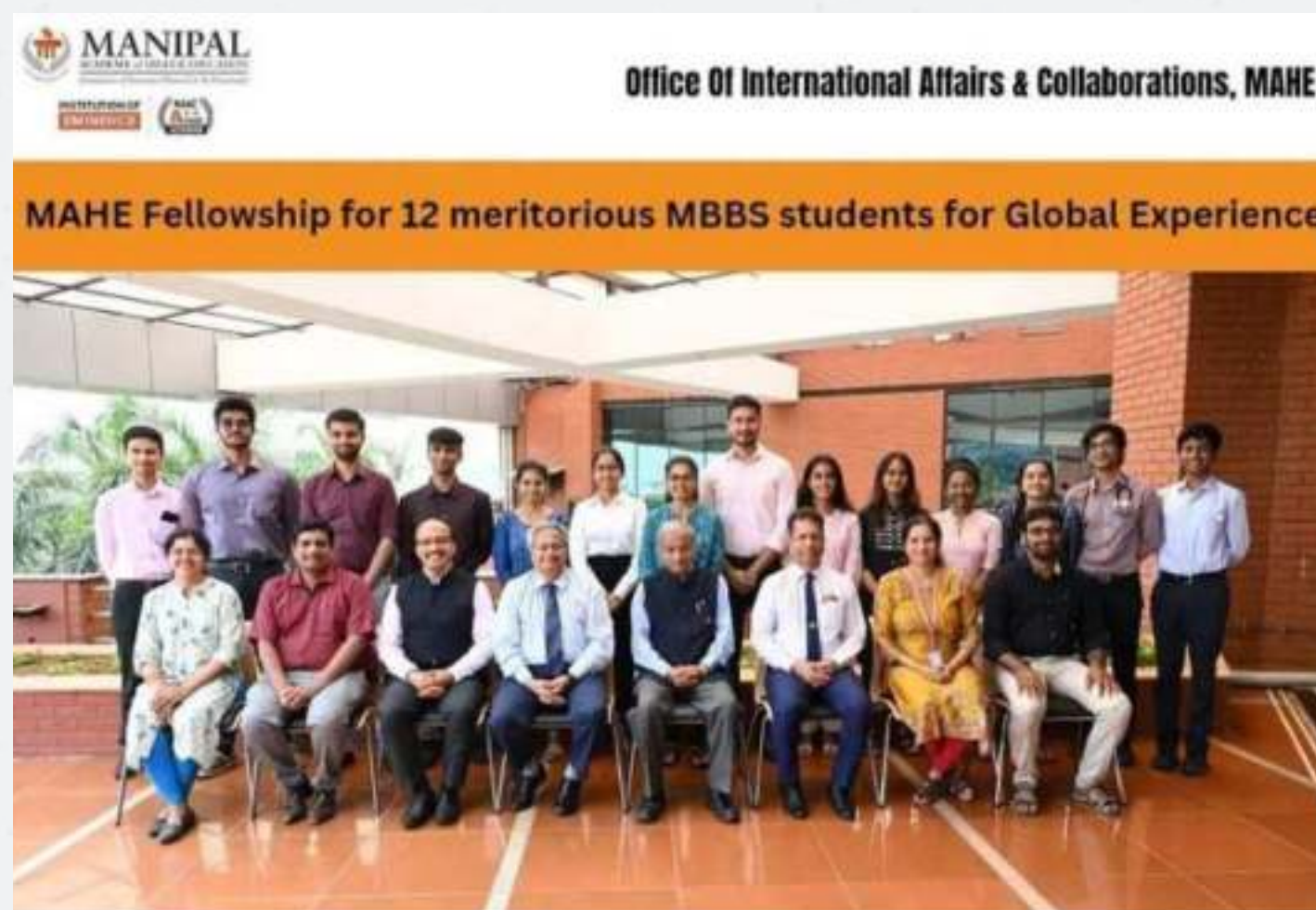
MANIPAL Office Of International Affairs & Collaborations, MAHE MAHE Fellowship for 12 meritorious MBBS students for Global Experience