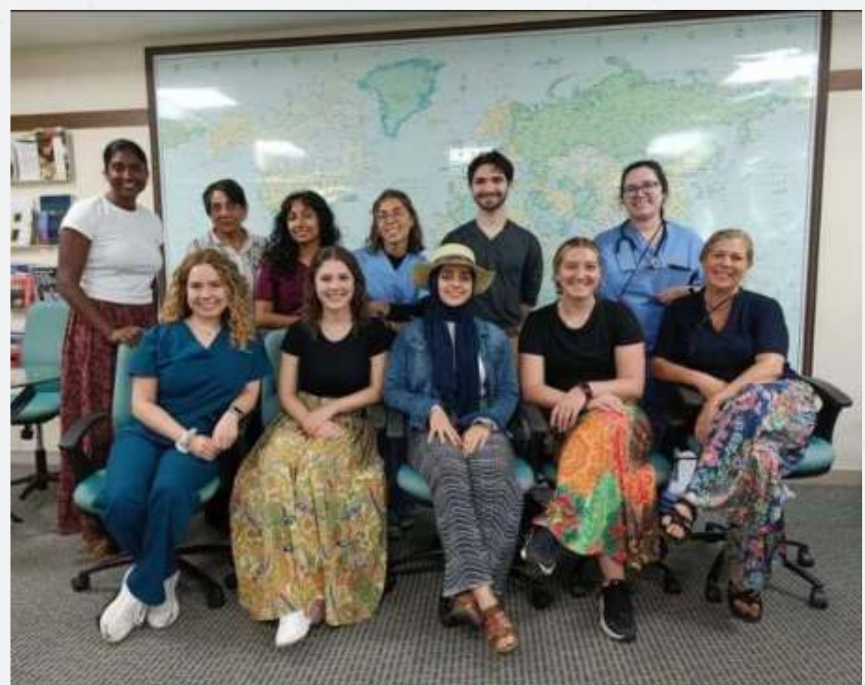
Lewis Katz School of Medicine at Temple University, Pennsylvania & Central Michigan University, US