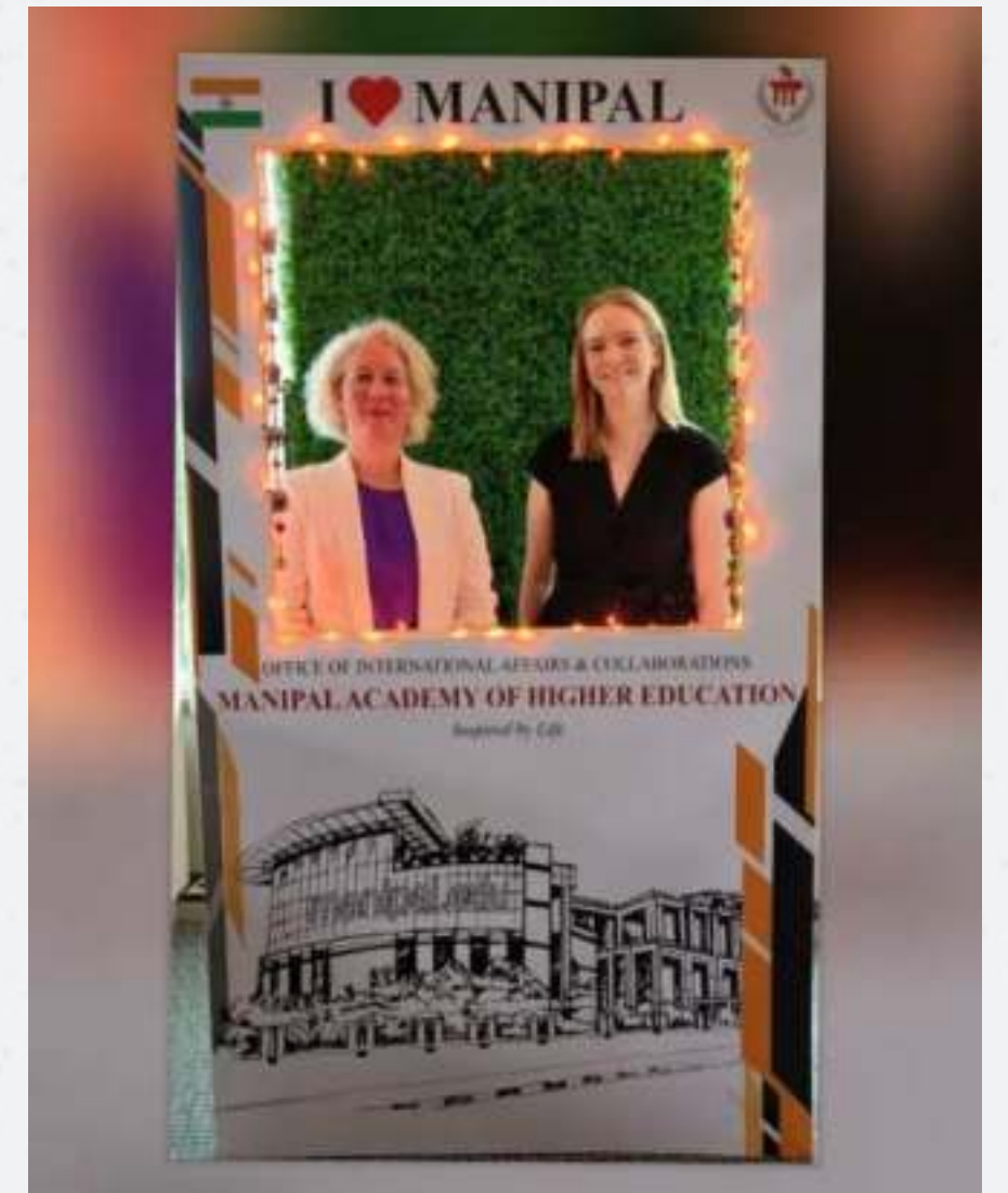
Australian Consulate General