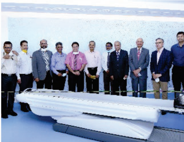
Kasturba Hospital Manipal has installed PET CT in the Shirdi Sai Baba Cancer Hospital block. (22 Aug 2020)