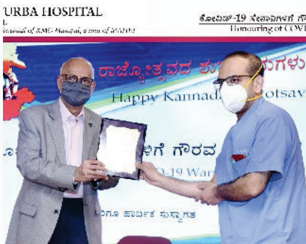
Honouring of COVID-19 Warriors. Faculty of Dept of Critical Care (20 Nov 2020)