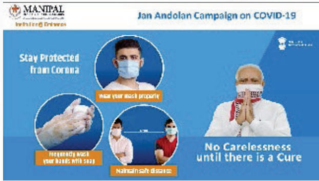
UGC Jan Andolan Campaign on COVID-19 - By Department of Immuno Haematology & Blood Transfusion (13 Oct 2020)