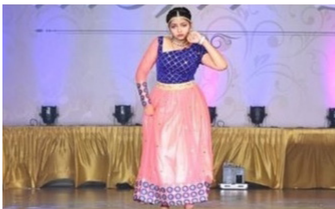
Eastern Dance Solo