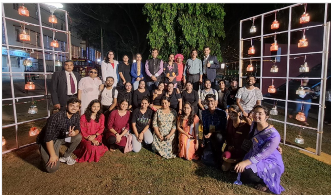
Staff Variety Entertainment Team